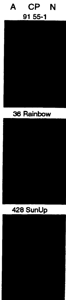
Figure 2. Comparative nuclear run-on transcription assays of nuclei isolated from leaves of CP hemizygous 55-1 and Rainbow and CP homozygous SunUp transgenic papaya. Nuclear transcripts of Rainbow 36 and SunUp 428 plants were hybridized with 32 P labeled probes specific to Actin (A), PRSV HA 5-1 coat protein (CP), or NPTII (N) genes. The CP/A ratio of labeled transcript for each run-on was 1.7, 2.0, and 3.8 for 55-1, Rainbow 36, and SunUp 428, respectively. Note that northern blots were also done for Rainbow 36 and SunUp 428 plants as shown in Figure 3.

Nucleotide identities between the CP sequences of the isolates and PRSV HA 5-1 ranged from 89.5% to 99.8% (Table 4). Isolates from Hawaii had the highest sequence identities with PRSV HA 5-1 (96.7-99.8%). Interestingly, of the Hawaii isolates, the KE and KA